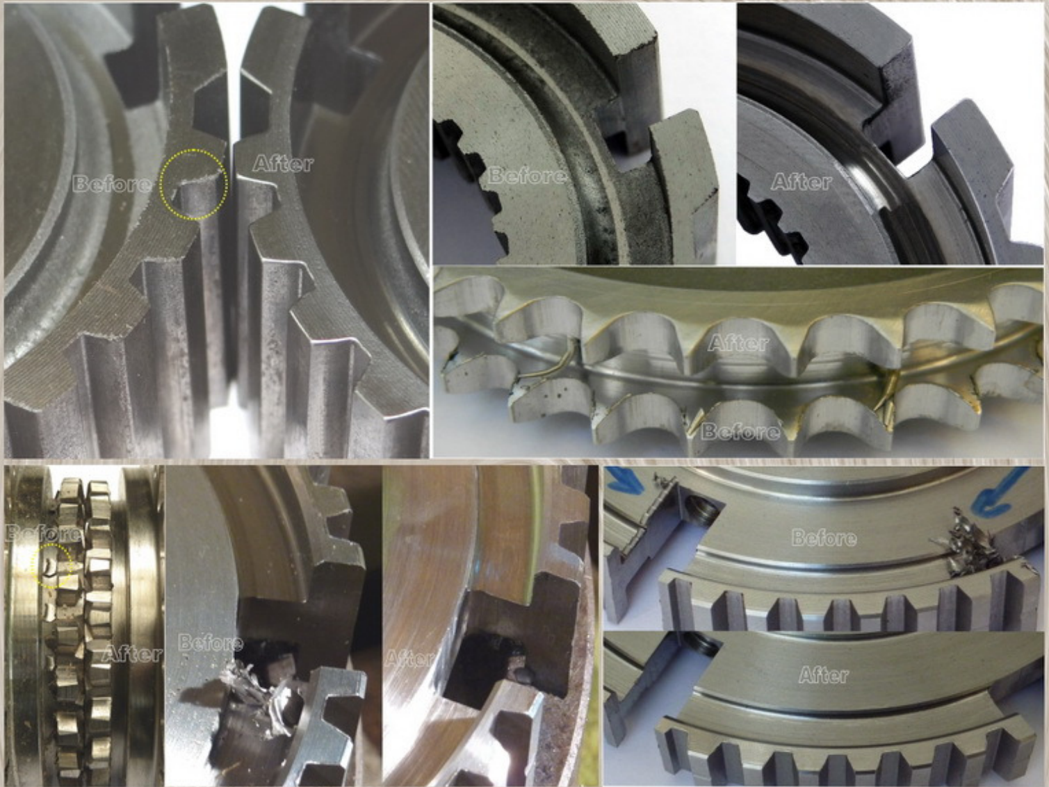
Photos reflecting the Burr in slot with Sharp Chamfered Edge, Rust, Turning mark.